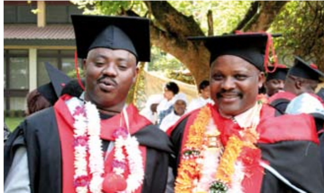
► B.A. Graduands in happy moments