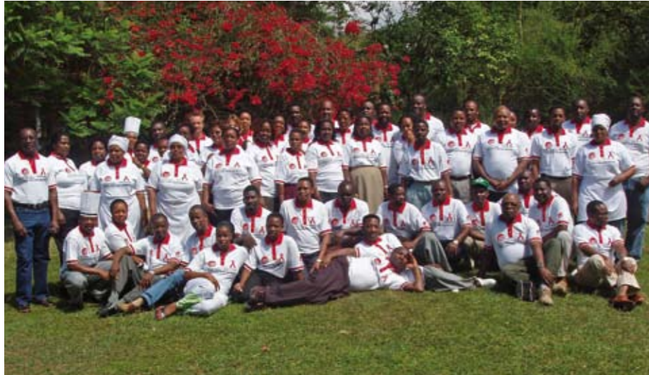
► MS-TCDC staff

Welcome to the 2010 training programme in MS Training Centre for Development Cooperation (MS-TCDC). This programme continues to reflect our vision of becoming a global centre of excellence in good governance & democracy that was articulated in 2008. We believe looking at this year's program that we have come a long way already.