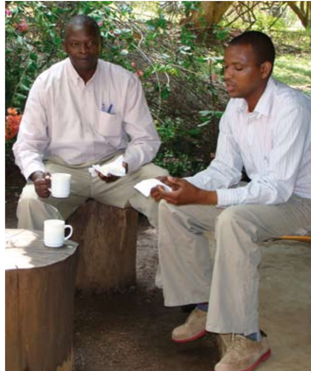
► Course participants enjoying their tea

The course is intended for senior and middle level civil society organisations practitioners and especially NGO/CBOs practitioners.