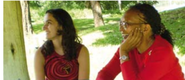
► Course participants relaxing during break

This is a two-week programme with a total of 60 teaching hours, which include excursions. This course is intended for participants who have completed beginners' course. It is offered twice a year and is basically for fast learners who would like to get the intermediate level in less than the normal three weeks. The pace is very intense.