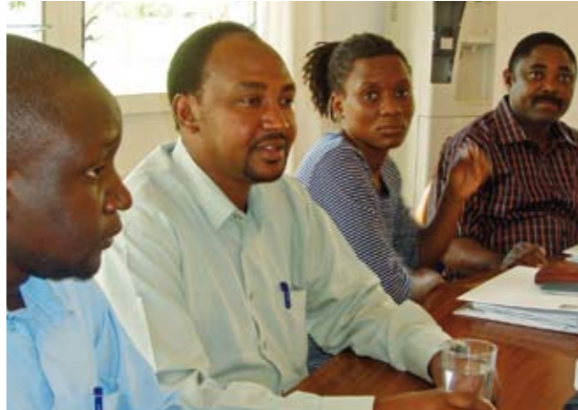
► Course participants in class

The Development Training Department offers Short Standard Courses in two areas; namely courses for strengthening internal governance and learning and courses enhancing development impact, democracy, good governance and policy change. The Development Training Department also offers a Development Studies course which is awarded an Ordinary B.A. by the Higher Education and Training Awards Council (HETAC, Ireland). We offer supplementary courses upon request and also tailor-made courses and consultancies. Finally, we implement longer-term of 2 – 3 years scope, actual development programs/ special programs. Currently we have two ongoing programs aiming at: