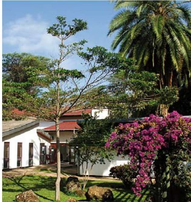
► Tuition area