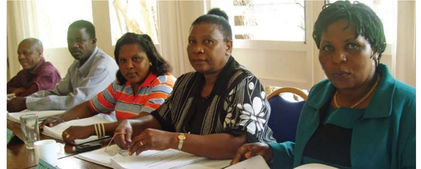
► Course participants in class