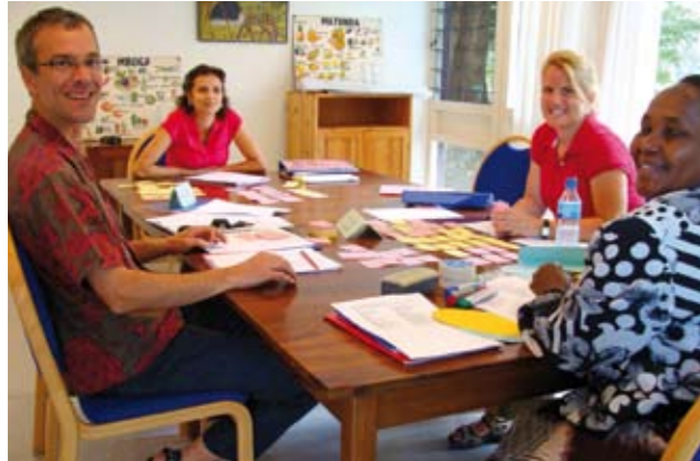
► Course participants in class