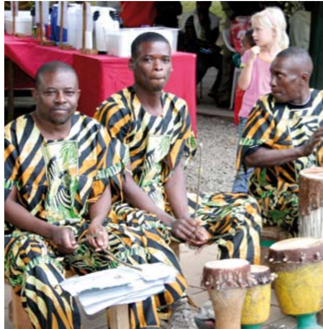
► MS Ngoma Troupe entertaining