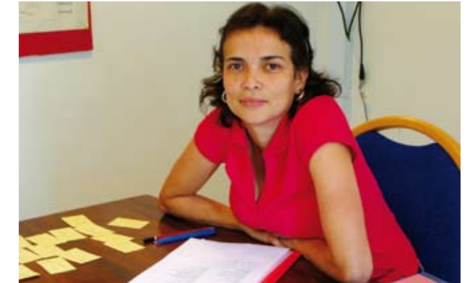
► Course participant in class

This is a two-week programme with a total of 60 teaching hours, which include excursions. This course is intended for participants who are fast learners since the pace is very intense.