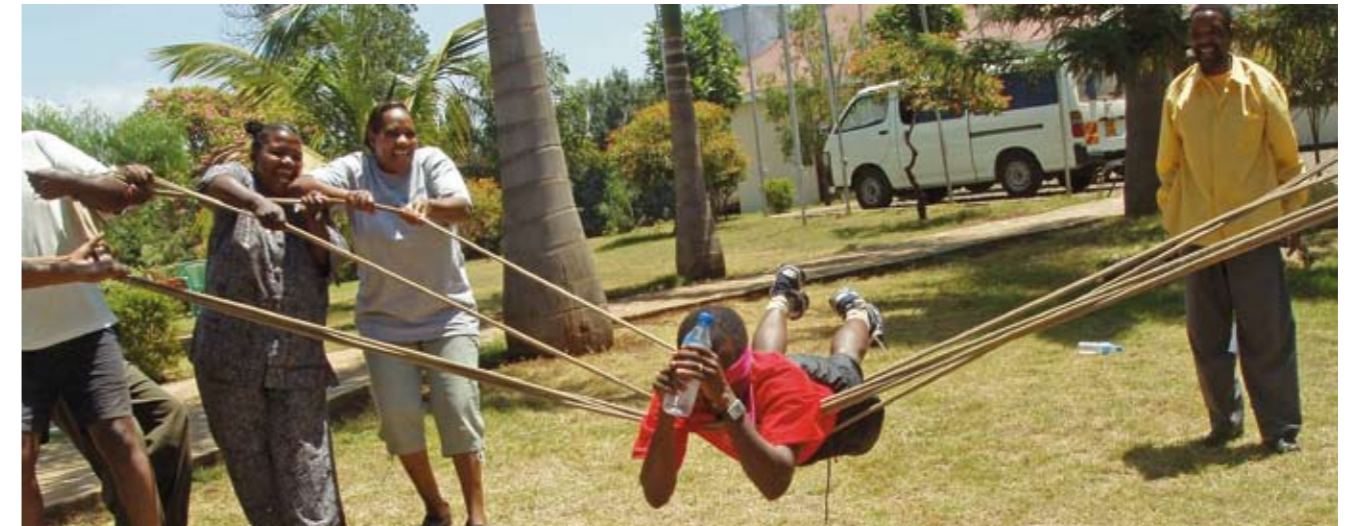
► MS-TCDC staff in team building exercise

Forum Syd of Sweden with whom, we have initiated a special programme on making local government accountable in Tanzania. www.forumsyd.org