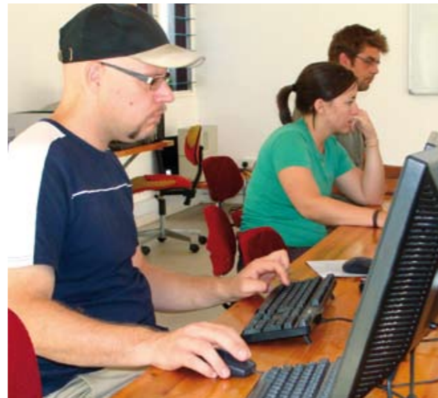
► Course participants in computer room

We offer a three weeks Kiswahili Beginners course throughout the year, with a total of 90 teaching hours including excursions. This programme is intended for participants who have recently arrived in East Africa and require a basic introduction to the Swahili language.