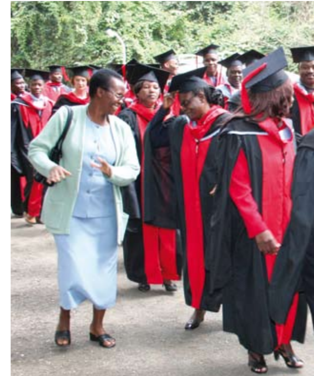
► B.A. Graduands in procession