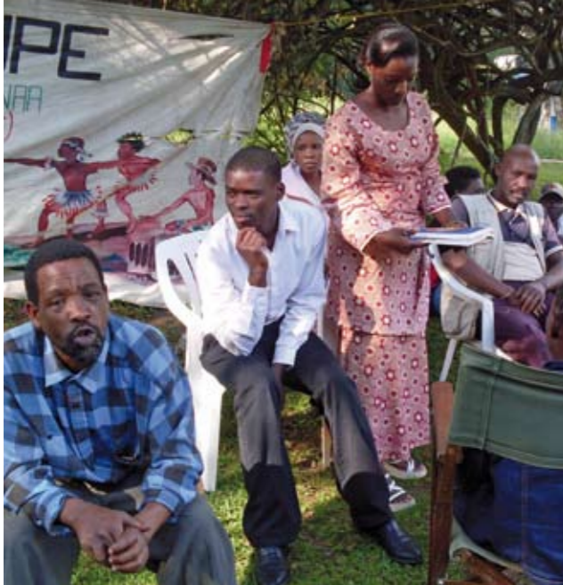
► MS-Ngoma Troupe in role play on governance

Democracy and democratisations processes form the core of all MS AAI's work. This covers work in the field of local democratic governance – characterised by the constructive engagement of citizens and civil organisations with local government and state agencies as well as market organisations at the local level.